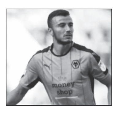
Romain Saiss 30th August 2016

The Moroccan international midfielder arrived from Ligue 1 side Angers on a four-year-deal.