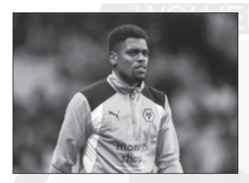
Ivan Cavaleiro 31st August 2016

The highly-rated Portuguese international arrived from AS Monaco on a five-year-deal. He became Wolves record signing for a fee reported at £7 million.